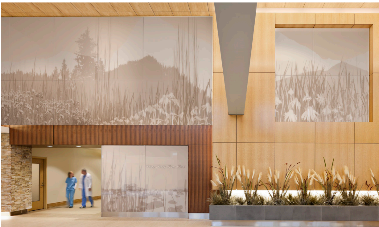
Baystate Health by Steffian Bradley Architects

Project Challenge: Create a calming environment that mirrors Baystate Health's re-engineered work flow in its new state-of-the-art facility in Springfield, Massachusetts. Balancing technology with nature in the 600,000-square-foot campus addition was important to support this hospital's rhythm for healing. Adhering to principles of The Green Guide for Health Care™, the facility incorporates eco-friendly materials and generous use of natural light throughout the hospital—especially in its five-story atrium at the building's core.