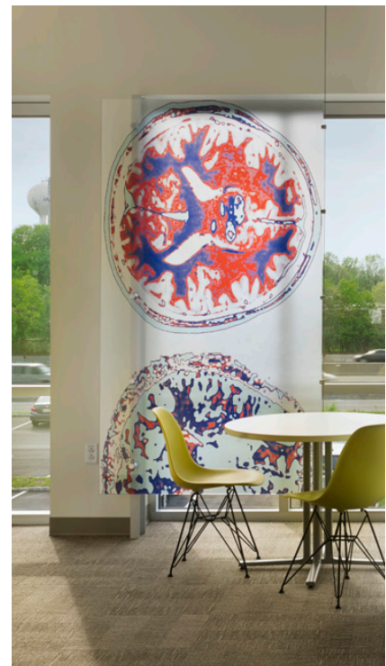
Bracco Diagnostics by KSS Architects