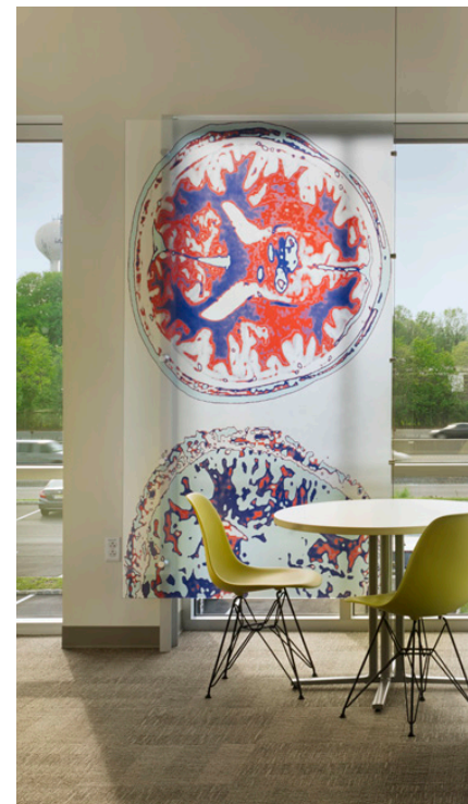
Bracco Diagnostics by KSS Architects