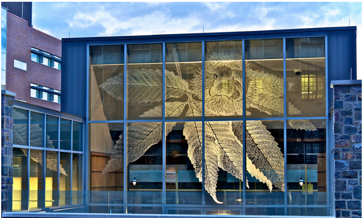
Lehigh University by Bohlin Cywinski Jackson Architects